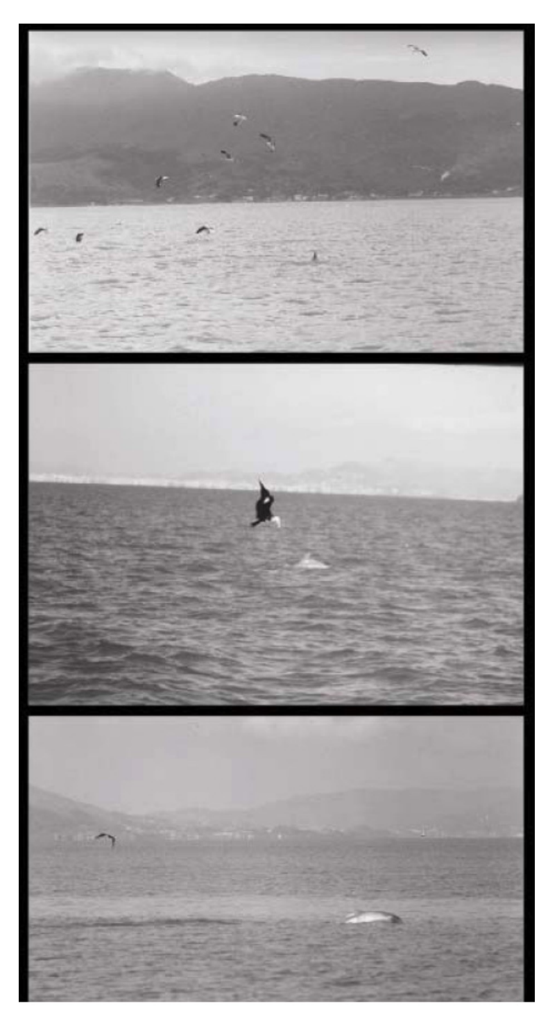
Fig. (3). Examples of the foraging interactions between Guiana dolphins Sotalia guianensis and seabirds in the North Bay, Santa Catarina State, Southern Brazil. Top and bottom: interactions between S. guianensis dolphins and kelp gulls Larus dominicanus ; Middle: interaction among one S. guianensis dolphin and one frigatebird Fregata magnificens .

The Table 3 shows that SS was the species with more observed interaction with the dolphins S. guianensis , with time varying from 510 minutes, in 1993, to 257 minutes, in