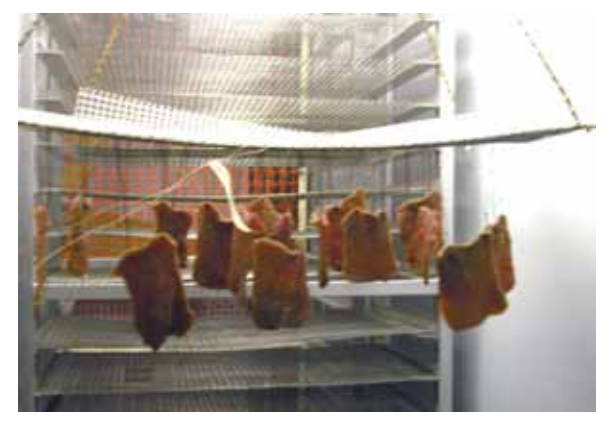
Fig. (2). Vertically oriented product suspended from the weigh pan using wire hooks.

Horizontal orientation was achieved by laying the jerky slices directly on the weigh pan rack shown in Fig. (1). Wire hooks were used to vertically orient product as shown in Fig. (2). Product pH was either left unadjusted (as is) or adjusted by adding about 7 ml of white vinegar (Great Value, Bentonville, AR) to the standard marinade recipe to reduce the pH of the meat to 5.2. Meat tenderization was included (high factor level) or excluded (low factor level) from the process. Tenderization was accomplished by adding 1mg of tenderizer (Liquipanol T100, Enzyme Development Corp., NY) per 454 g of meat to the marinade. Beef strips were soaked in the marinade for 60 min at room temperature.