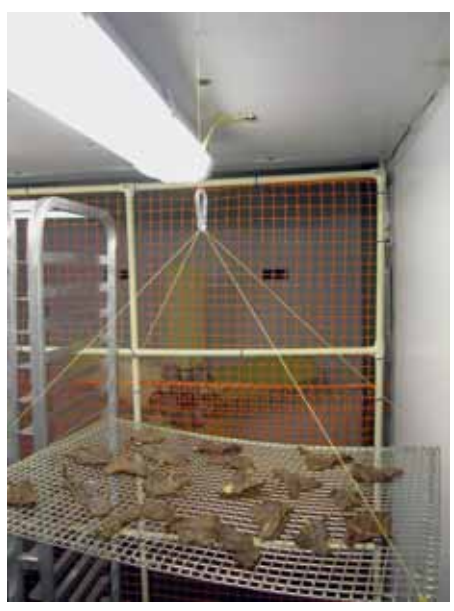
Fig. (1). Weigh pan setup in dehydrator for continuously monitoring weight loss of product.

A small-scale, low-cost dehydrator with a raw product capacity of 130 kg [5] was selected for jerky processing. Temperature variations within the dehydrator were known to be minimal and air flow was uniform [12]. The dehydrator was outfitted with two live weigh pans to measure product moisture loss during the dehydration process. The weigh pans were 62 x 41 cm stainless steel mesh grills. The mesh was 3.2 mm in diameter, spaced 1.3 cm on center. The weigh pans were each suspended by a Kevlar thread (strand size 346, #8800K43, McMaster-Carr, Santa Fe Springs, CA) which was passed through a 3.2 mm hole in the ceiling of the dehydrator as shown in Fig. (1). A digital force gage (FGV-5XY, 2 kg, Shimpo Corp. Instrument Division, Kyoto, Japan) was mounted outside of the dehydrator and attached to