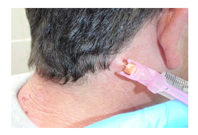
Fig. (3). Occipital nerve block.

administrating the injection. To identify the injection site, various sites on the patients head and neck are palpated with the tips of the index and middle fingers using firm circular pressure while paying close attention to the suboccipital and anterior temporal areas. Anterior pressure is applied to the general area where the greater occipital nerve penetrates the semispinalis capitis muscle located approximately two finger breaths inferior to the superior nuchal line and one to two finger breaths lateral to the occipital protuberance. For the anterior temporal area, pressure is applied to the slight depression just posterior to the lateral orbital rim and superior to the zygomatic arch. According to the authors, the appropriate site for injection is indentified when focal pressure reproduces or increases the patient's headache symptoms. The next step is the intramuscular injection for which a 50/50 mixture of 2% lidocaine and 0.25% bupivacaine buff-