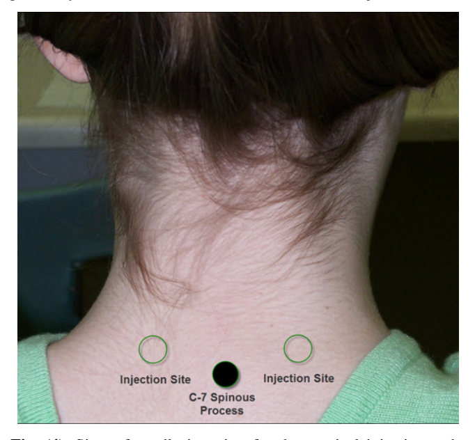
Fig. (4). Sites of needle insertion for the cervical injection technique.

ered with a 1/10 volume of 8% sodium bicarbonate is used. A 27-gauge needle on a 5 ml syringe is inserted through the area of maximal tenderness until the needle makes contact with the cranium. To make contact with the inferior portion of the occiput bone, the needle is guided in a 45-60 degree angle superiorly. Once the needle is at the periosteum, continuous pressure is applied on the syringe and each focally tender area is "fanned" with 1- 5 ml of anesthetic solution by moving the needle in multiple directions, in and out of the tender area. Aspiration to avoid injection into a vessel is generally not recommended if the solution is injected simul-